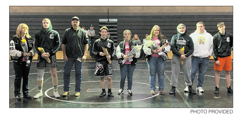
Outlaws seniors honored their parents at last week's wrestling meet.

your effort to not just your teammates but also to improving yourself physically and mentally, I believe more parents would encourage their children to participate and the children would have more of a