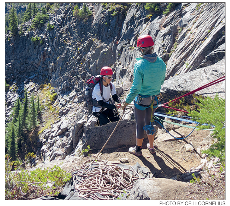
Students learn outdoor skills —and build confidence and teamwork.

from experts in the field, outdoors, applying what they learn in the classroom to the place where they live.