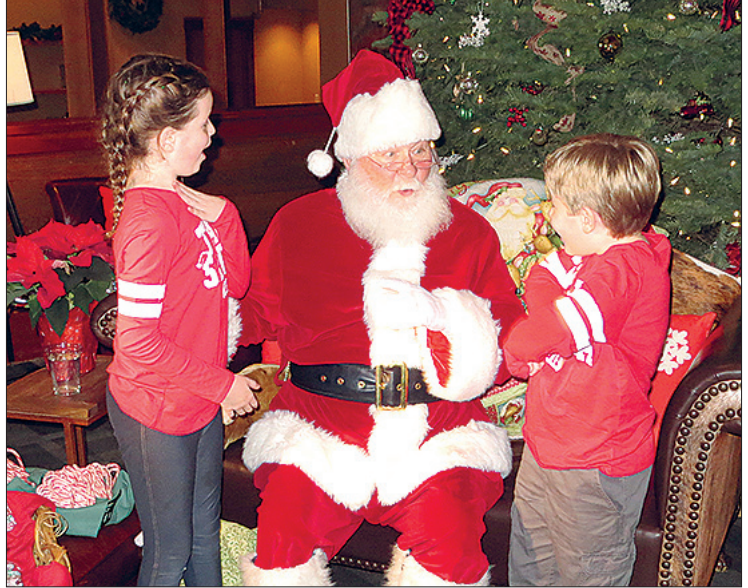
Families crowded The Lodge at Black Butte Ranch so that children could have some time with Santa Claus.

Breakfast with Santa is part of Black Butte Ranch's set of traditional holiday activities, which also includes tours of the Ranch in a wreath-decked carriage.