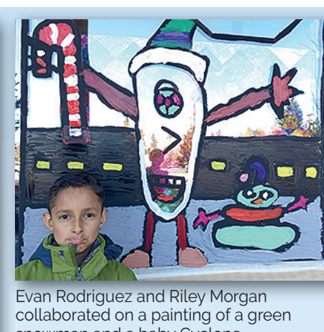
snowman and a baby Cyclops

Students added holiday cheer to windows along Cascade Avenue, including these at Stitchin' Post. Christmas spirit