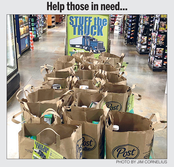
Ray's Food Place offers an opportunity to buy a bag of groceries for the Sisters Kiwanis Food Bank.

Sisters 541-771-0320 • Redmond 541-388-3091