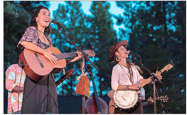
Rising Appalachia performed at the 2019 festival. Early-bird tickets for 2020 go on sale Monday, December 9.