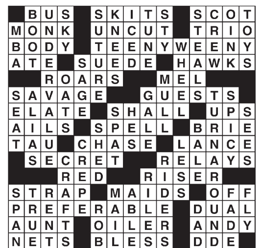
©2019 Tribune Content Agency, LLC All Rights Reserved. 11/28/19