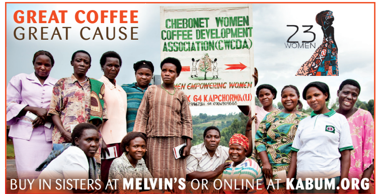
BUY IN SISTERS AT MELVIN'S OR ONLINE AT KABUM.ORG