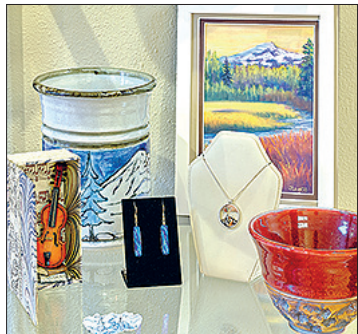
"Small Works" by artists at Hood Avenue Art.

Sisters' very own rendition of a Portland musical phenomenon. The acclaimed Low Bar Chorale will help C4C and Sisters stage our town's very first "Let's Sing!" event on Friday, Nov. 22. This free event – which offers two full hours of good cheer and singing with abandon – begins at 7:30 p.m. at The Belfry. Singers and non-singers of all ages and abilities are welcome. Through music, C4C aims to create a more engaged, empowered, and connected Sisters. Doors open at 6:30.