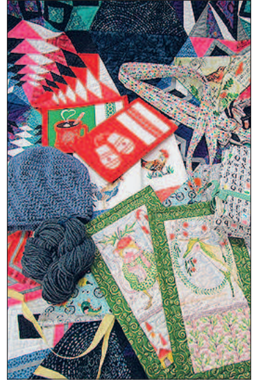
"Arts and Crafts Boutique" by the staff at Stitchin' Post.

After the artwalk, you can immerse yourself in community camaraderie during