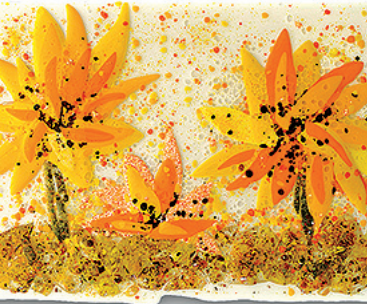
In celebration of fall, Jill Neal's Gallery features new images on canvas and lots of "Wild Women, Wild West," all served with red wine and chocolate. Look for sale items just

degree in fine and industrial art, he immigrated to the United States and eventually settled in Sedona, Arizona. His work is in museums, churches, and collections worldwide; and his portrait of President Dwight Eisenhower is included in Gettysburg's Museum Hall of Presidents. He continued to paint until age 95, two years prior to his death.