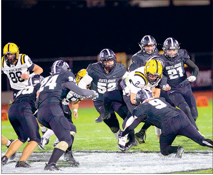
The Outlaws defense was stout, but the Cougars ultimately prevailed in a