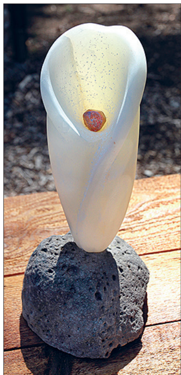
A stone calla lily.

As Saturday wore on, the sculptors began to pack their gear and load their rigs for the long trek home. But they will be back next summer. It's set