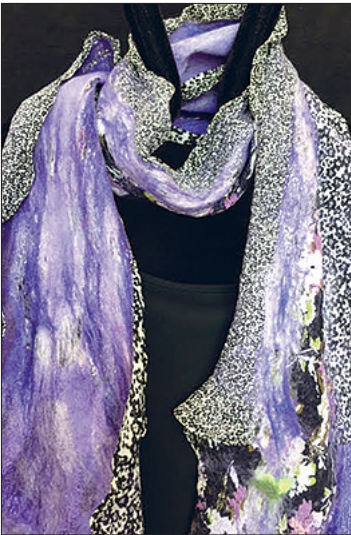
“Nuno-felted Scarf” by Tricia Biesmann at ZoselHarper Realtors.

some new “wild women,” as well as new products. Stop by for wine, chocolate, wild women and Wild West!