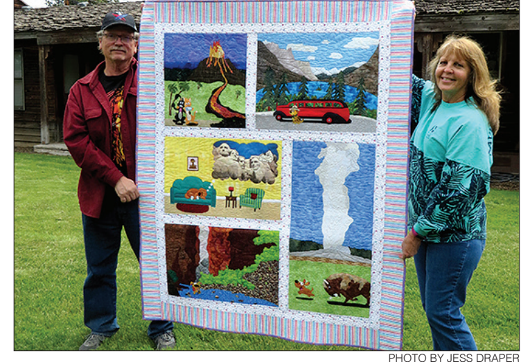
A new quilt celebrates national parks – and pets.

neuter sponsorships with the goal of helping families in need in Sisters. Sometimes a pet owner only needs a few weeks of food to assure their pets can stay with the family. The FFF mission is to help