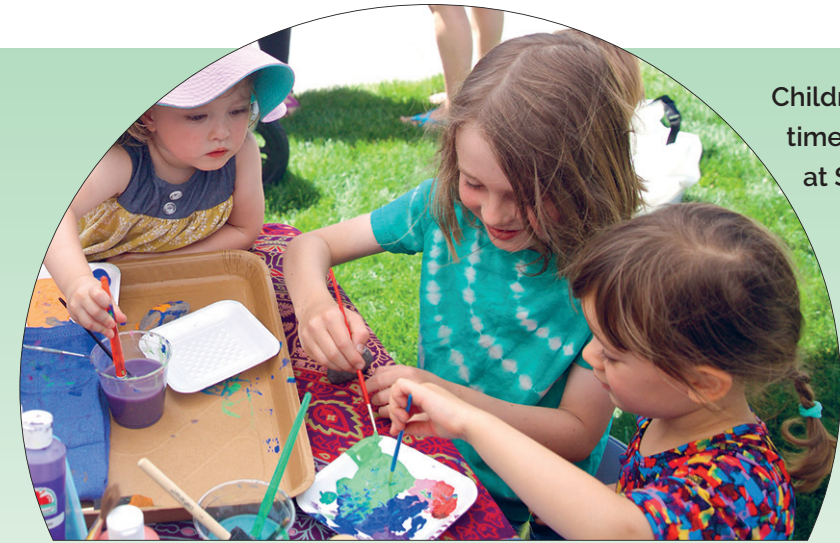
Children had a great time painting rocks at Sisters Farmers Market.