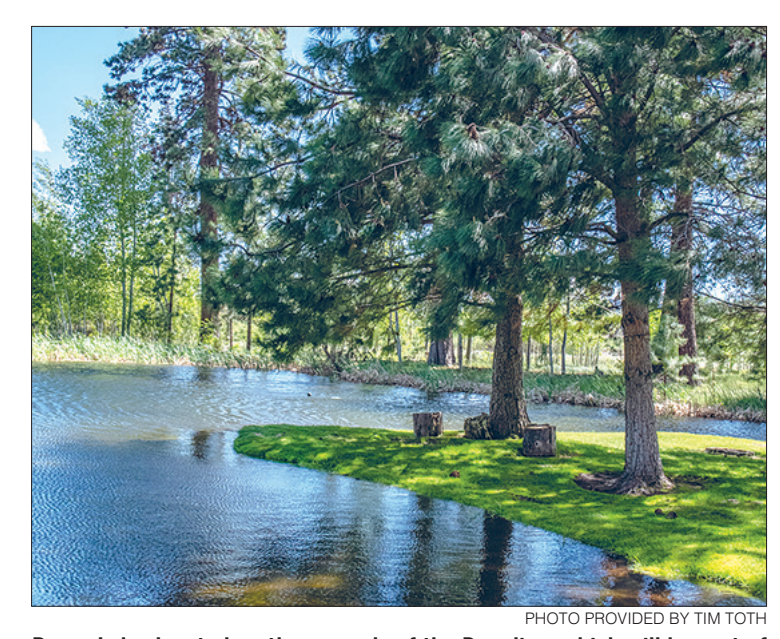
Bruce Lake, located on the grounds of the Rognlien, which will be part of the Quilts in the Garden Tour on July 11.

Between the ponderosas standing off the deck in the backyard, visitors will be able to view a series of 25 small art quilts displayed depicting the story told in Eastern Oregon author Pamela Royes's memoir, "Temperance Creek."