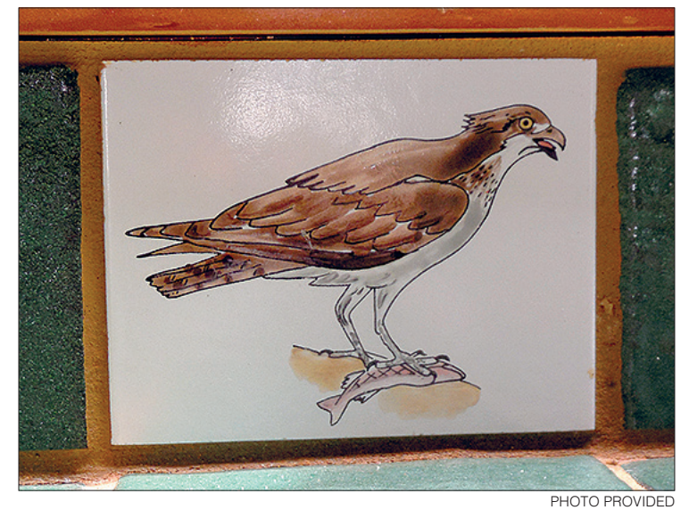
Specially crafted kitchen tile depicting residents of Hawks Haven Reserve.