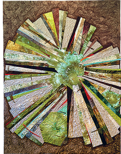
"Inspired By Nature" exhibit by June Jaeger at Stitchin' Post.

Photographs by Lisa Belt are featured at The Collection Gallery. Lisa finds it an honor to be included with