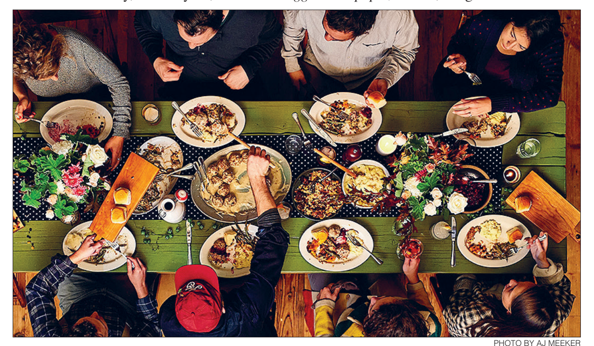
The Suttle Lodge's Chef's Dinners are served in a convivial family-style atmosphere.

supports the visual arts, offering residencies during the win-