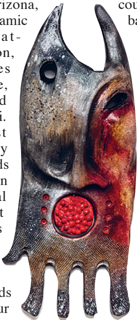
Salmon Hand sculpture featured at Raven Makes Gallery.

The Clearwater Gallery features all of its gallery artists this month.