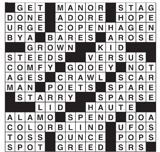
©2018 Tribune Content Agency, LLC All Rights Reserved. 10/4/18