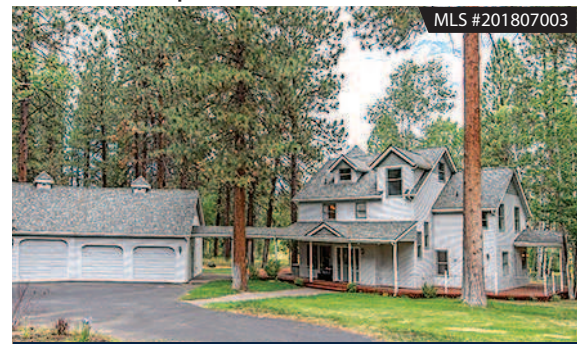
MT. JEFFERSON & SAGE MEADOW VIEWS 3 BD | 2.5 BA | 2,760 SF | 0.99 ACRES | $674,500

Suzanne Carvlin | 541.595.8707 Ellen Wood | 541.588.0033