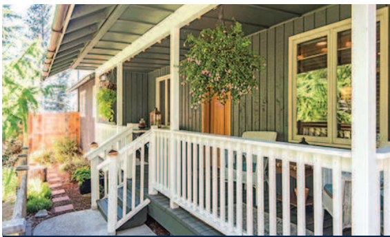
DOWNTOWN CITY OF SISTERS LIVING! 3 BD | 2.5 BA | 1,665 SQ FT | MLS # TBD | $405,000

Suzanne Carvlin 541.595.8707 | suzanne.carvlin@cascadesir.com