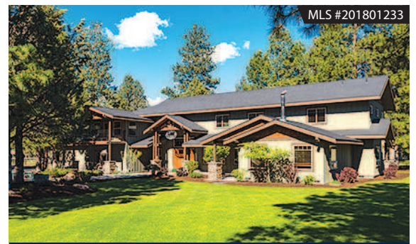
RIDE TO FOREST OR 1 MILE TO TOWN 5 BD | 6 BA | 5,567 SF | 2.21 ACRES | $1,249,000

Suzanne Carvlin 541.595.8707 | suzanne.carvlin@cascadesir.com