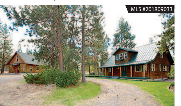
67445 BASS LANE, BEND 3 BD | 2 BA | 2,164 SF | $669,000

Phil Arends 541.420.9997 | phil.arends@cascadesir.com