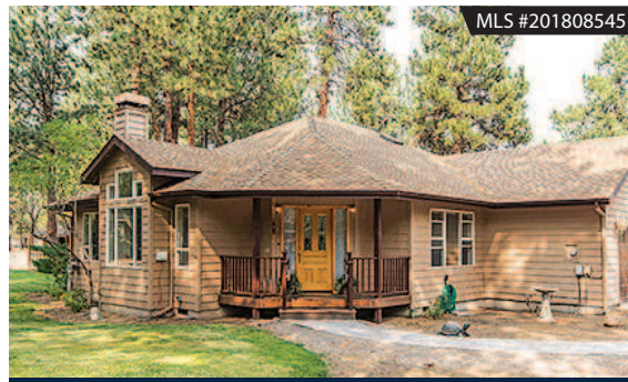
SAGE MEADOW | 69632 OLD CORRAL LP. 3 BD | 2 BA | 1,798 SF | 1.07 ACRES | $465,000

Brian Ladd & Bryan Hilts 541.771.3200 | bhilts@bendpropertysource.com