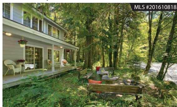
MCKENZIE BRIDGE - RIVER RETREAT 4 BD | 3 BA | 2,886 SF | 2.57 ACRES | $599,900

Ellen Wood 541.588.0033 | ellen.wood@cascadesir.com