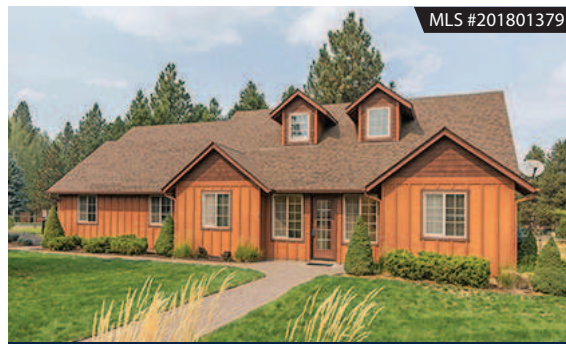
VIEW BLACK BUTTE 3 BD | 2 BA | 2,288 SF | 0.45 ACRES | $439,500

Suzanne Carvlin 541.595.8707 | suzanne.carvlin@cascadesir.com