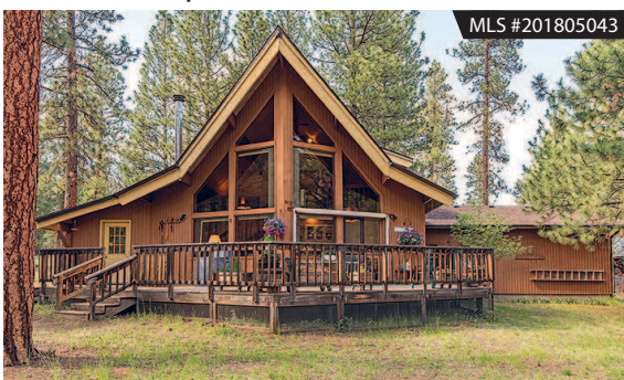
BACKS TO NATIONAL FOREST IN SISTERS! 3 BD | 2 BA | 1,912 SF | 1+ AC | $459,900

Suzanne Carvlin 541.595.8707 | suzanne.carvlin@cascadesir.com