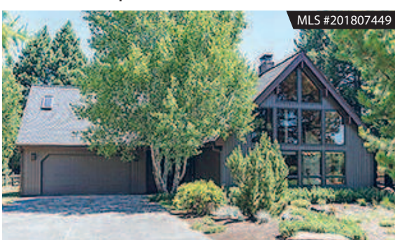
METOLIUS MEADOWS HOME 4 BD | 2.5 BA | 2570 SF | $435,000

Patty Cordoni 541.771.0931 | patty.cordoni@cascadesir.com