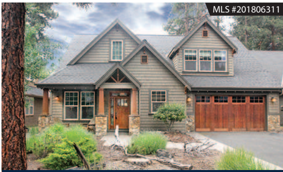
935 E CREEK VIEW DR, TIMBER CREEK 4 BD | 2.5 BA | 3,078 SF | .27 AC | $725,000

290 E CASCADE AVENUE SISTERS, OR 541.588.6614 CascadeSothebysRealty.com