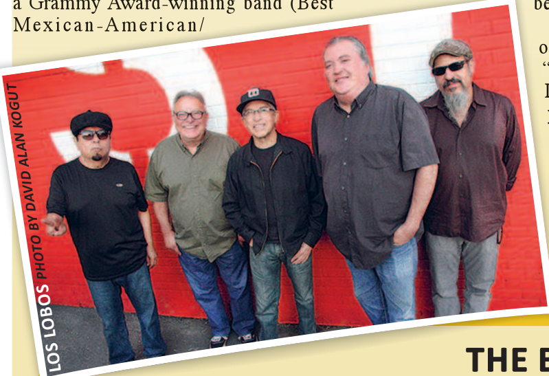
LOS LOBOS

For more information or to buy tickets visit sistersrhythmandbrews.com .