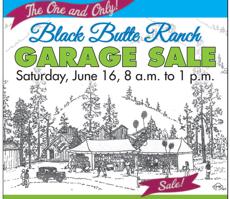
An Estate Sale sponsored by The Black Butte Ranch Art Guild