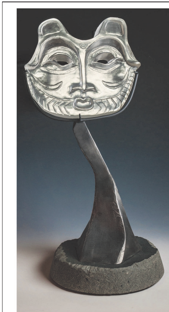
She Who Watches Granite Base, Steel Stand, Cast New Zealand Lead Crvstal, 24”h