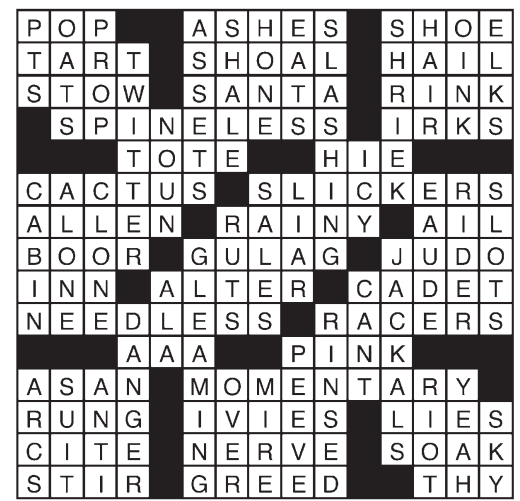
©2017 Tribune Content Agency, LLC All Rights Reserved. 11/30/17