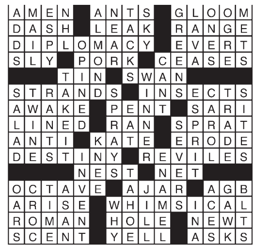
©2017 Tribune Content Agency, LLC All Rights Reserved. 10/5/17