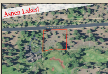
16947 Golden Stone Views on the beautiful 12th Green of Aspen Lakes Golf Course! 0.86 acre lot is ready for your dream home. $249,000