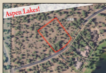
16856 Golden Stone Building opportunity on 2.01-acre lot in Aspen Lakes Golf Course. Plus 2 years of free golf! $399,000