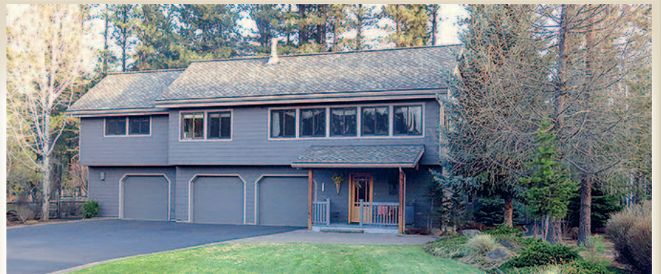
26324 SW Metolius Meadows Dr. Beautiful contemporary 4-bedroom, 3.5-bath home adjacent to National Forest, close to Lake Creek and Black Butte School. Spacious living room and kitchen have vaulted ceiling with wood beams. Gourmet kitchen, granite counters, office/den, 2 patios, garden with fruit trees. NEW PRICE! $499,900