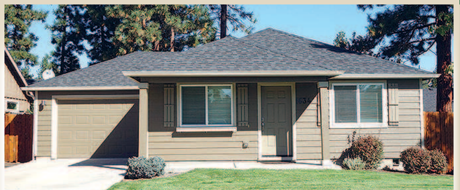
1634 W. Aitken Ave. Lovely cottage is perfect for the investor, first-time homebuyer or downsizer. Well-maintained 2-bedroom home. Larger lot with space for an RV. Close to schools, shopping and medical facilities. Front yard maintained by HOA. Park-like fenced backyard has sprinklers. Oversized garage. Open floor plan. $242,000