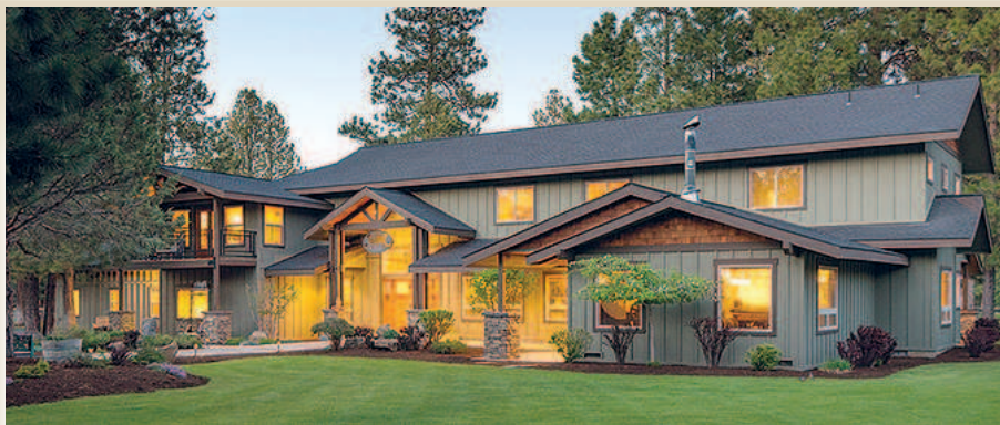
15630 Trapper Point Rd. Spectacular custom home on 2.21 acres with guest quarters and large shop on horse property! Greatroom anchored by a custom suspended staircase. Gourmet kitchen has two breakfast bars, granite counters with island. Master suite with balcony. Beautifully landscaped, fenced pastures. Ride to trails. $1,299,000