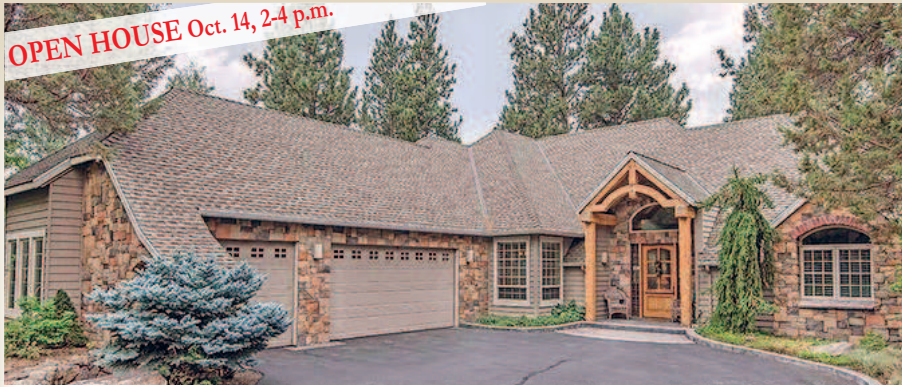
16812 Royal Coachman Dr. This gorgeous French-style chateau is stunning inside and out. Offering main-level living at its finest. Located on the 10th tee at Aspen Lakes resort. Two master suites, gourmet kitchen, architectural beams and stonework. Beautiful back patio offers a tranquil setting surrounded by pristine landscaping. $889,000