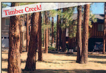
956 Timber Pine Dr. Build your dream home on this .17-acre lot in Sisters' Timber Creek neighborhood. All utilities in place at the street. $121,000