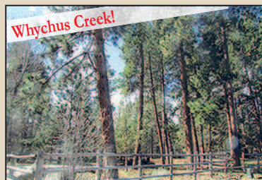
380, 390 & 400 S. Timber Creek Dr. Opportunity to build your dream home by Whychus Creek. In town, close to everything! $195,000 each