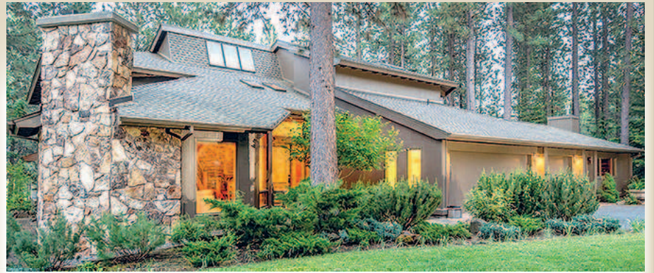
13440 Galium GM 368 Stunning, estate-quality home on picturesque lot. Completely updated and remodeled with gourmet kitchen, ground-floor luxury master and attached office/den, beautiful finishes and 3-car garage. With 5,166 sq. ft., 5 bedrooms and 4.5 baths, there is plenty of room for everyone! An exquisite property! $1,849,000