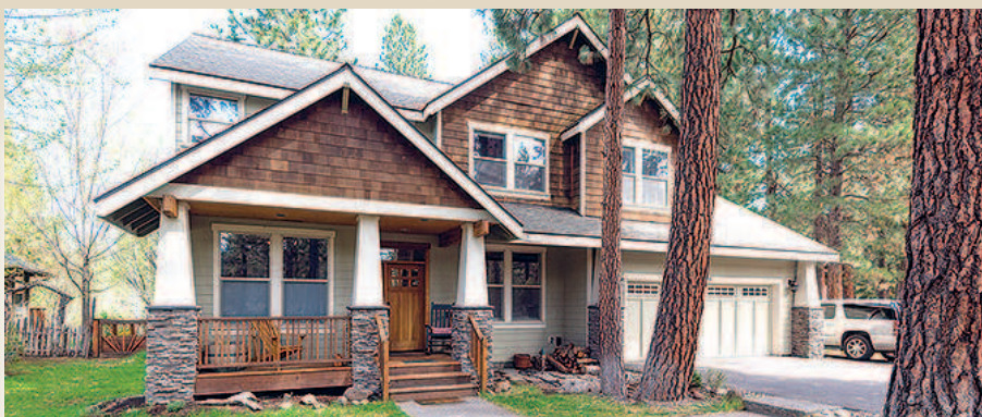
1016 E. Creekside Ct. Great location on Whychus Creek! This beautifully detailed custom craftsman home has everything you want! Greatroom with wood fireplace, 4 bedrooms + bonus + office, upstairs laundry, bamboo floors and carpet, 3-car garage, fenced yard and hot tub! Chef's kitchen. Spacious master. Close to downtown! $625,000