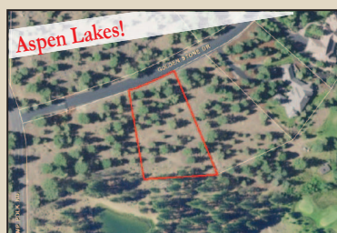
16827 Golden Stone Aspen Lakes 1.12-acre building lot with beautiful golf course views and golf course amenities. $274,900