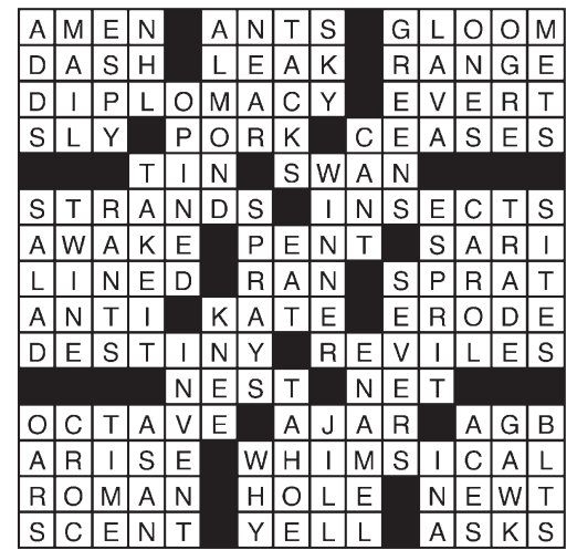
©2017 Tribune Content Agency, LLC All Rights Reserved. 10/5/17