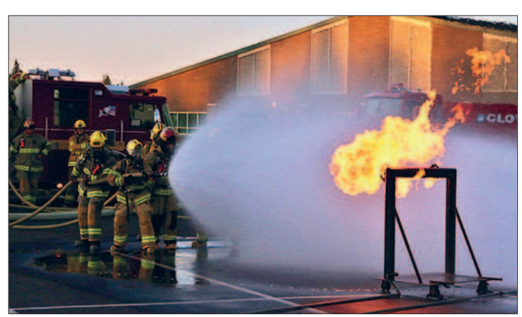
Cloverdale and Sisters fire district personnel took training on handling flammable liquids and gases last week.

Trainers and training props were provided by the Oregon Department of Public Safety Standards and