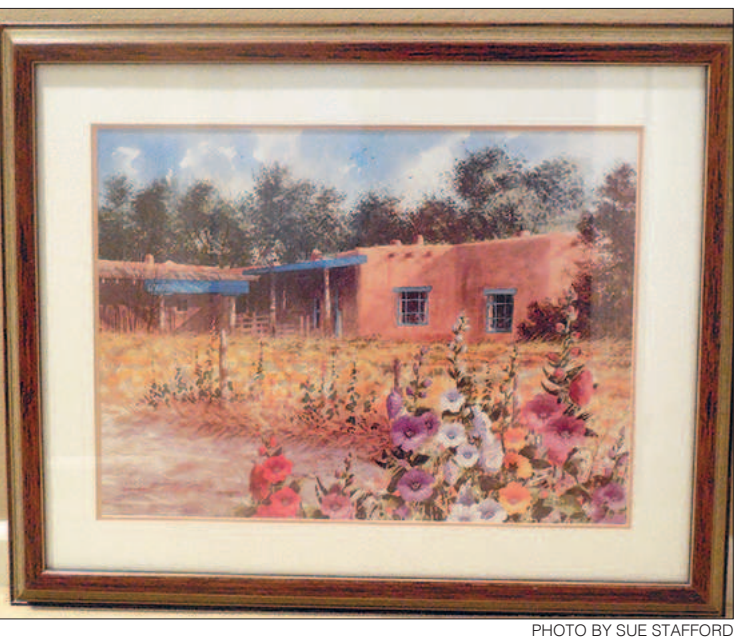
Friends of the Sisters Library is hosting a pre-owned art sale.

For comparison, the school says a typical airliner cruises at an altitude of 39,000 feet.