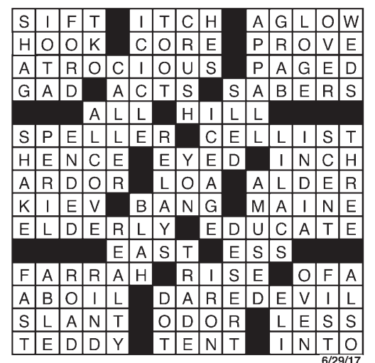
©2017 Tribune Content Agency, LLC All Rights Reserved. 6/29/17