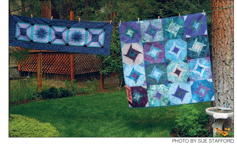
Quilts will hang in gardens across Sisters Country for a special tour.

According to Garden Club President Larry Nelson, another property containing acreage will showcase the use of natural materials for ease of maintenance in our deerladen, quixotic climate.