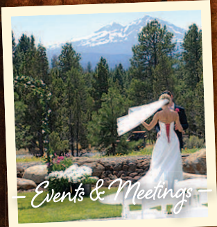
Events & Meetings