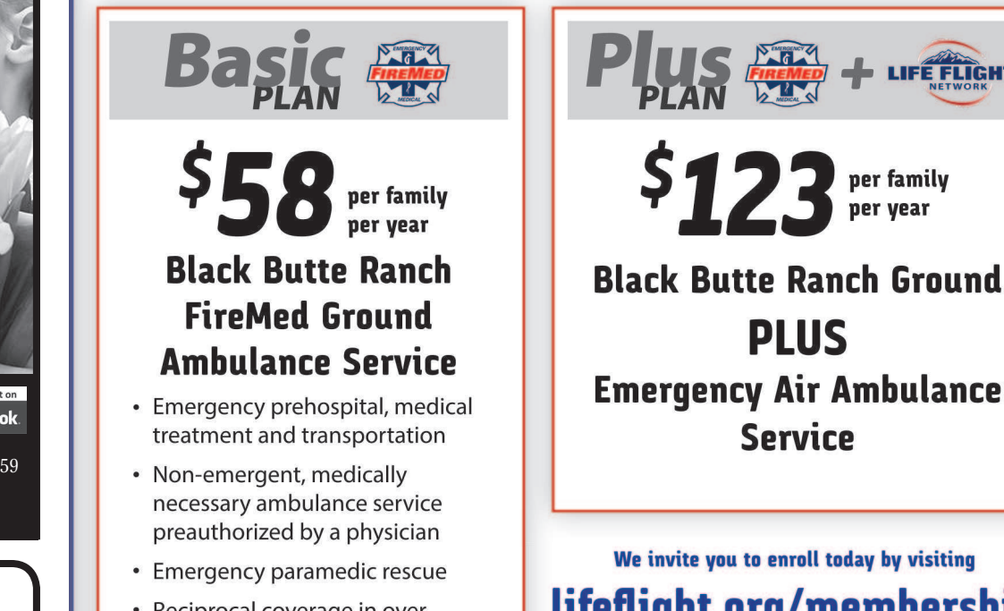
Reciprocal coverage in over 64,500 square miles in Orego