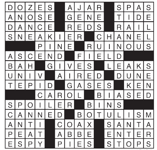
©2017 Tribune Content Agency, LLC All Rights Reserved. 2/23/17