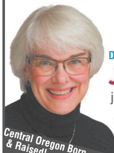
Central Oregon Born & Raised!

REVERSE MORTGAGES HOME LOANS ... AND MORE! Some items may be brokered products.