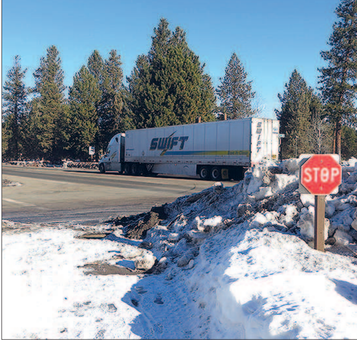
The roundabout at the Barclay intersection is still on schedule.

ODOT personnel will provide exhibits of the planned roundabout, which is expected to be open by Memorial Day. Other upcoming projects include: Highway 20/Highway 126 junction - Deschutes River