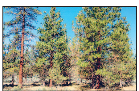
17786 WILT ROAD

One of the few remaining buildable lots along the Deschutes River with 75' of water frontage, National Forest across the river. Established neighborhood on a quiet, dead-end street. Lots of wildlife, including deer, eagles and osprey. Elk have been known to winter in the area. Minutes to Old Mill District and downtown Bend. BMPRD is working on plans for a future footbridge for river trail access. Fabulous location for a vacation home or permanent residence $299,000. MLS#201605172