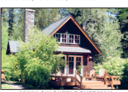
25553 SW SUTTLE SHERMAN

Prime Pine Meadow Village lots in a cluster. Three of the 7 have been built and plans are available for the remaining lots. Lots can be purchased as a group or individually. Close to town and THE BEST DEAL IN PINE MEADOW VILLAGE! $110,000/each. MLS#s: 201602888, 201602889, 201602891, 201602894