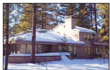
70635 PINE DROP

Daniel Boone wants to live here. A log home of 1,914 sf on 9.8 acres that borders public land and has a mountain view. Bamboo floors throughout most of the home. Spacious vaulted living room with doors to the front porch. The efficient kitchen opens to the cozy family room that includes a woodstove for added warmth on a chilly morning. 1 BR/1 BA downstairs. 2 BRs and a 2nd bath up. A detached office, pump house that has storage room and a sand volleyball pit. All within the Sisters School District. $367,000 MLS#201602241