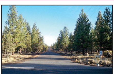
YOU BELONG HERE

Beautiful 2-bedroom, 1-bath, 972± sq. ft. Metolius riverfront cabin with wood-burning riverrock fireplace, knotty pine paneling and open greatroom. Enjoy south-facing upriver views. Hike, bike, x-country ski, fish and more right out the front door. Year-round vacation rental potential. Rental history available. View more info at http://www.metoliusriverresort.com. $349,000 MLS#201605778