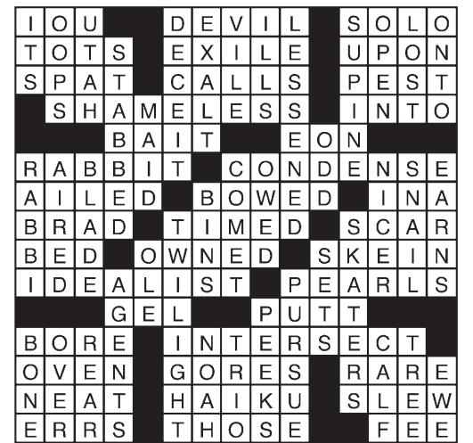
©2016 Tribune Content Agency, LLC All Rights Reserved. 12/15/16