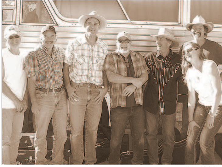
Dry Canyon Stampede serves up tasty country music.