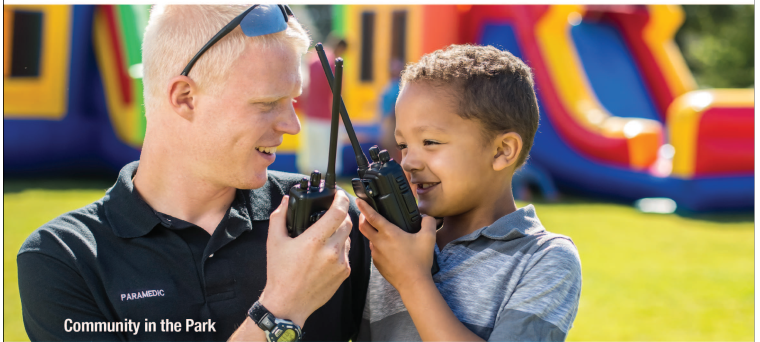
Community in the Park

“ St. Charles is a valuable partner to us. They support our event in multiple ways and serve side-by-side with us.”