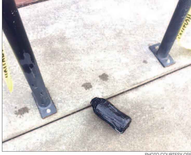
Youths duct-taped a bottle to hold it together for a game.

The Deschutes County Sheriff's Office encourages