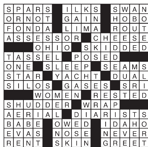
©2016 Tribune Content Agency, LLC All Rights Reserved. 10/20/16