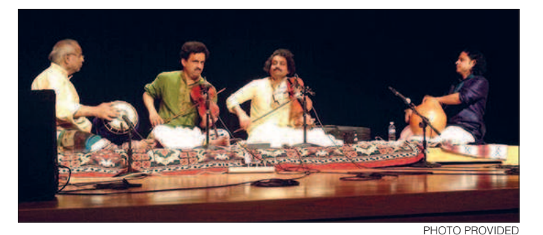
The Mysore Violin Brothers.