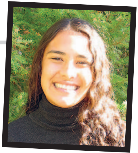
Counseling Intern, OSU-Cascades