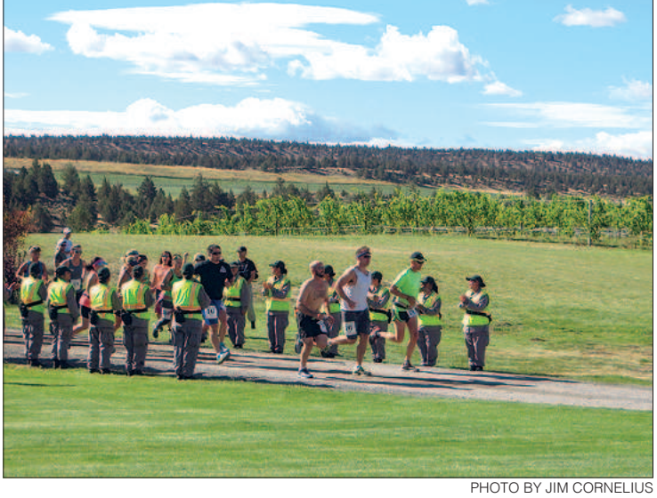
Runners head out on the Crush Cancer half-marathon.

The organization researches new ways for early cancer detection, develops effective treatments with fewer side effects, studies how to prevent cancers from growing in the first place, and much more. Fred Hutchinson Cancer Research Center provides research and information that benefits many people in the Pacific Northwest, including local