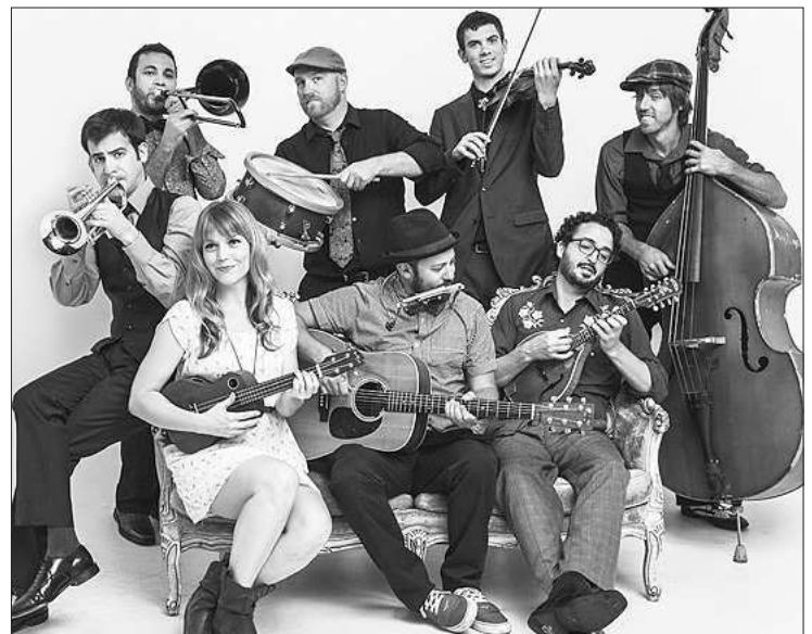
The Dustbowl Revival is headed to town to play The Belfry.

The Belfry is located at 302 E. Main Ave. in Sisters For ticket information visit www.bendticket.com.