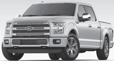
2016 Ford F-150