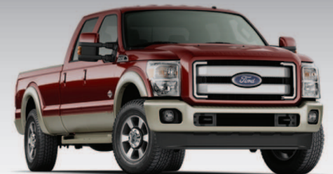
2016 Ford Super Duty

+$1,000 BONUS CASH Ford Credit APR Financing