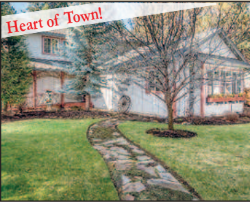
Heart of Town!

Immaculate home in Buck Run. Upstairs master with sitting room, second master on main, third bedroom/office. Large fenced backyard, patio. Perfect! $458,000