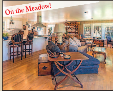
On the Meadow!

Mountain views and 9.77 acres of peace and quiet. 3-bedroom, 2-bath home. Large shop and connected, covered storage area. $479,500