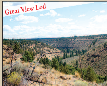
Great View Lot!

Build your dream home on this .17-acre lot in Sisters' Timber Creek neighborhood. All utilities in place at the street. $119,900