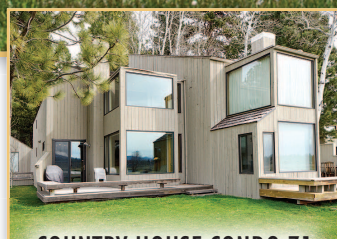
COUNTRY HOUSE CONDO 71 $469,000 MLS 201502389