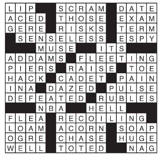
©2016 Tribune Content Agency, LLC All Rights Reserved. 7/28/16